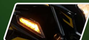
Integrated Front LED Turn Lights