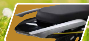
Attractive Rear Grip