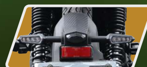
Rear LED Turn Light