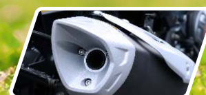
New Sporty Muffler