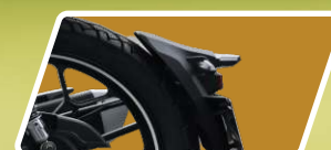
Rear Hugger Fender