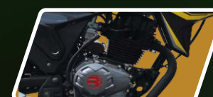
New Generation 150 CC Engine