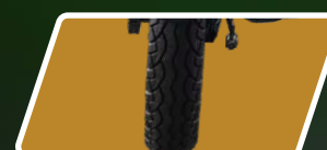
Tyre With Better Grip and Braking