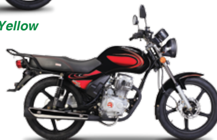
Gutsy Black with Red