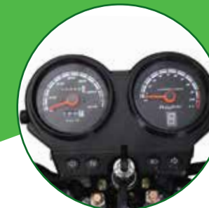
Speedometer (Trip Meter & Gear Indicator)