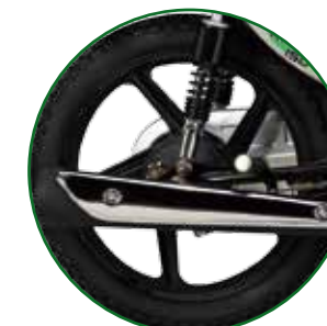
Chrome Plated Muffler Protector