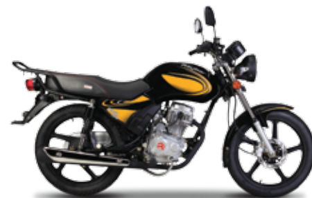
Magical Black with Yellow