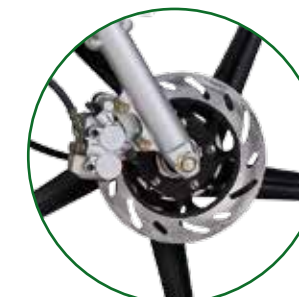
Double Cylinder Front Disc Brake

You wear many hats and mean much to many. So we want you safe at all times. A powerful braking system ensures just that.