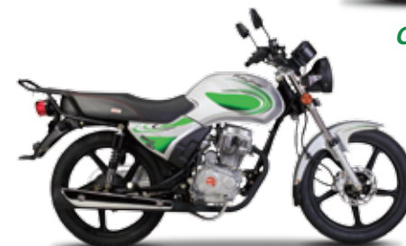
Sassy Silver with Green