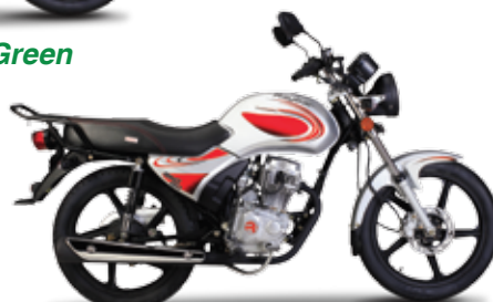
Fireball Silver with Red