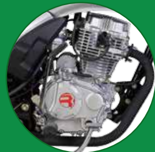
150 CC Engine

Turn the streets into stunning canvas of art. Feast to the eyes, envy to the hearts. Race ahead with a purpose. Race ahead of time with a stunner to call your own.