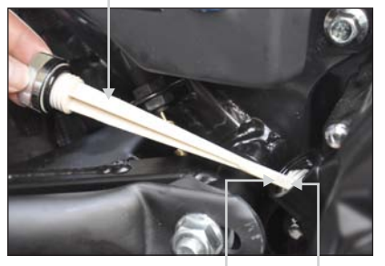
top line bottom line