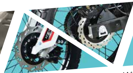
Front & Rear Disc Brake