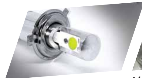
LED Lamp in Headlight