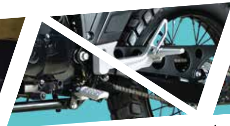
Front & Rear Foot Rest