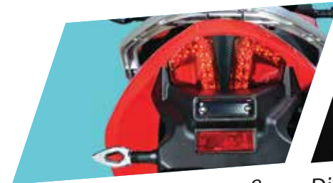
Stylish LED Indicators & Tail Lamp

Claim whatever comes your way as Volcano earns you the right of way all the way. Designed to deliver maximum speed with a powerful air cooled engine, this off roader gives you ultimate control. Unleash the force of this devil and feel the power to roam just about anywhere.