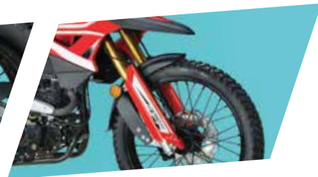
Inverted Telescopic Shocker